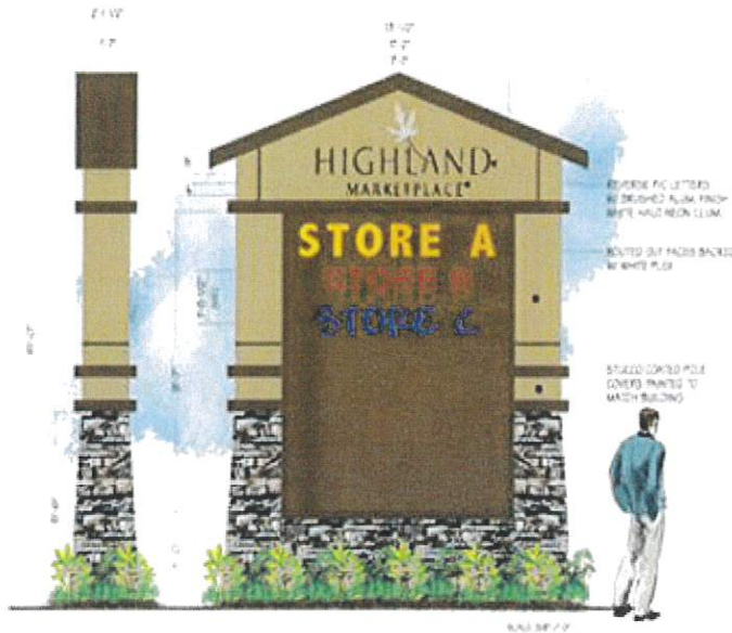
Figure 3-710.2 Example of preferred commercial freestanding sign

SECTION 6: REPEALER CLAUSE All ordinances or resolutions or parts thereof, which are in conflict herewith, are hereby repealed.